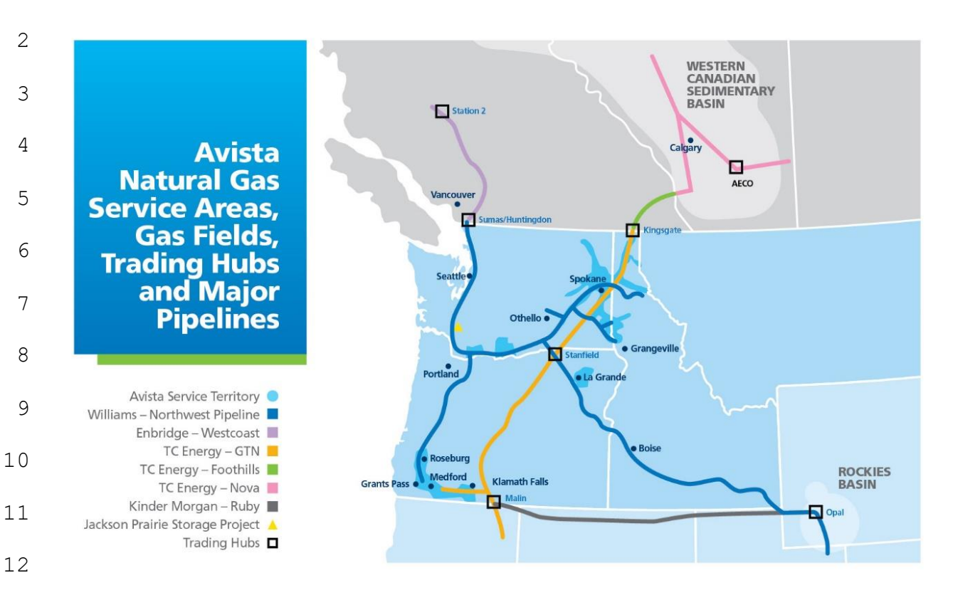
Illustration No. 1

Wholesale natural gas prices are a fundamental component of both procurement and integrated resource planning. Pacific Northwest natural gas prices can be affected not only by regional factors, but by global energy markets, and supply and demand factors from other regions within the United States and Canada. Price volatility and delivery constraints can have an impact on where our natural gas is sourced. Avista's diverse portfolio of natural gas supply resources allows the Company to make natural gas procurement decisions based on the reliability and economics that provide the most benefit to our customers.