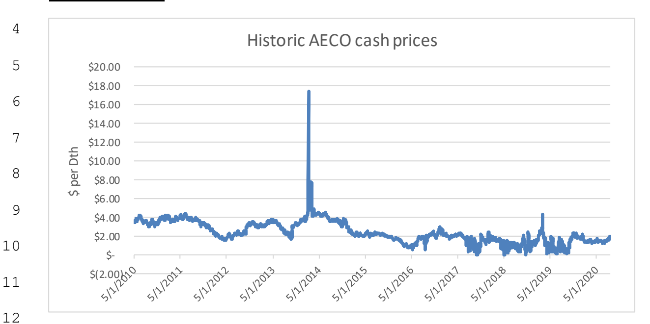
Illustration No. 3

Avista cannot predict with accuracy what natural gas prices may be. Our experience and intelligence related to market fundamentals guide our procurement decisions. By layering in fixed price purchases over time, setting upper and lower pricing levels on the Hedge Windows, managing the VaR of our LDC natural gas portfolio's open position on a daily basis, and actively managing storage resources, Avista is able to meet our goal of providing a meaningful measure of price stability and certainty, and competitive prices for our customers.